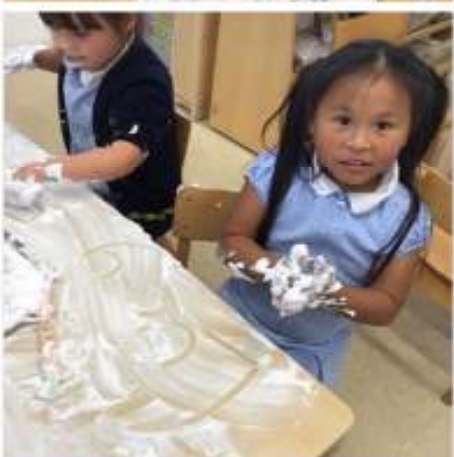
We also practiced writing our names in the shaving foam.